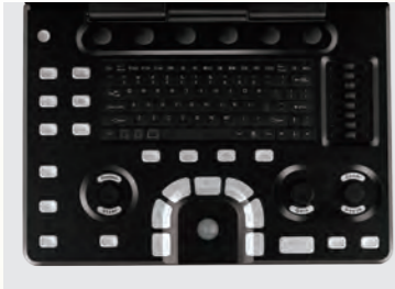
Physical keyboard for fast information input