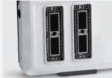
Two probe ports