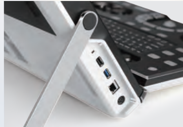
Multi-functional handle for quick stand when needed